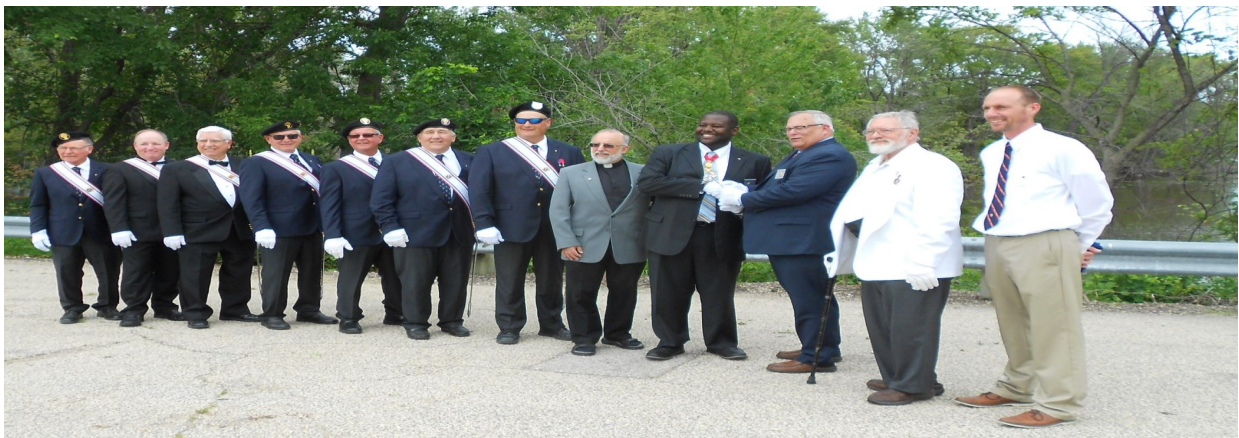
Transferring of the Silver Rose through Wisconsin jurisdiction.